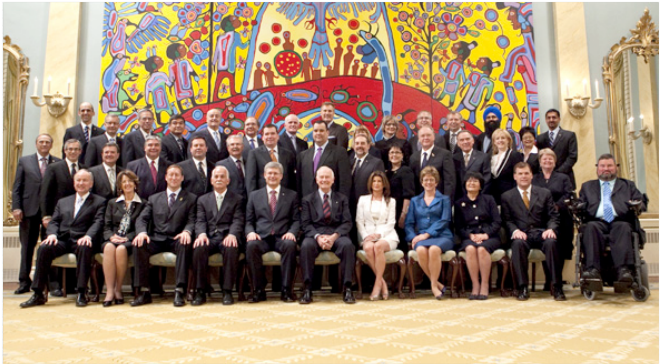
Queen's Privy Council for Canada AKA - "The Government"